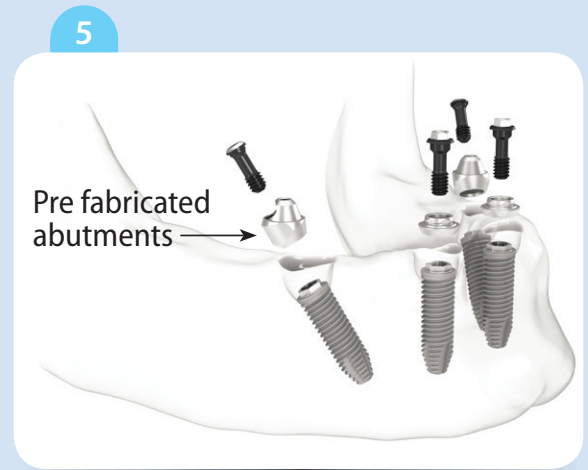
Image 5: Prefabricated abutments-Connections between the dental implant and the Fixed Denture

The patient will return for occasional check-ups over the next several weeks and months.