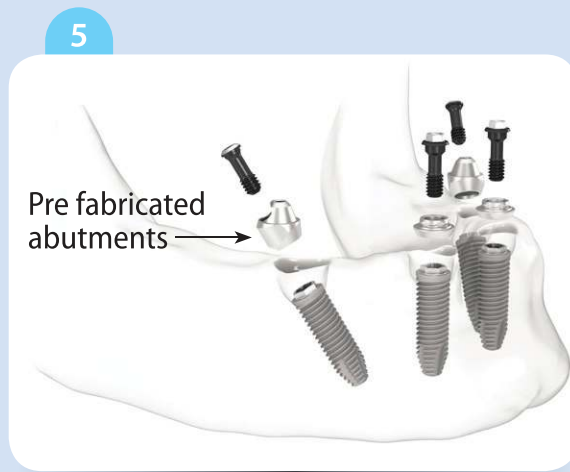
Image 5: Prefabricated abutments-Connections between the dental implant and the Fixed Denture

The patient will return for occasional check-ups over the next several weeks and months.